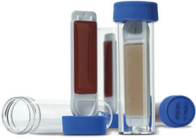
Envirocheck® Contact Slide